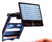
Video Magnifier/ CCTV

Auditory supports, such as listening to books, may be used with any literacy medium.