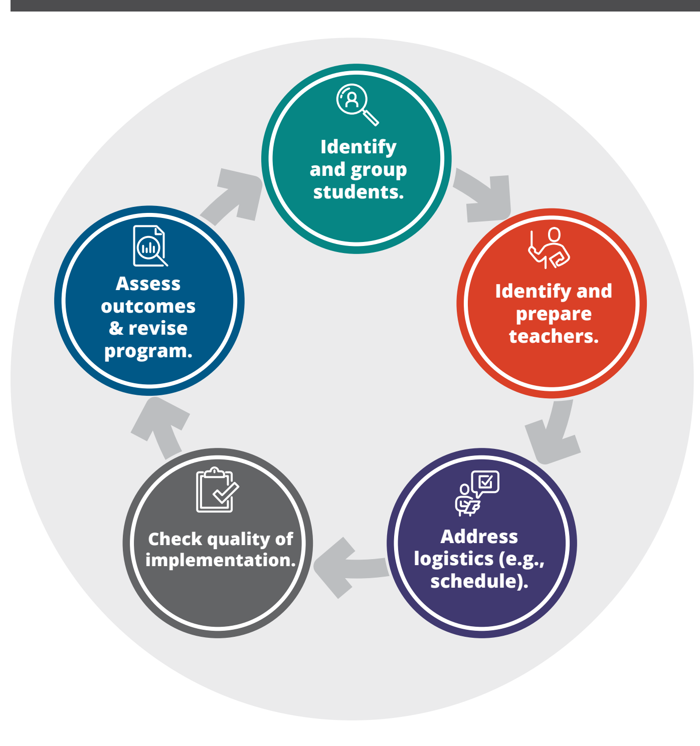
Figure 11: Annual Implementation of Co-Teaching